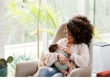
Nursing Mother Rooms