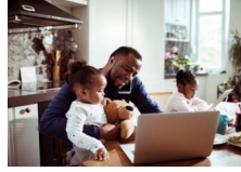
Toolkits for Parents