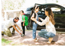
Ease Anxiety Related to Return-to-Work